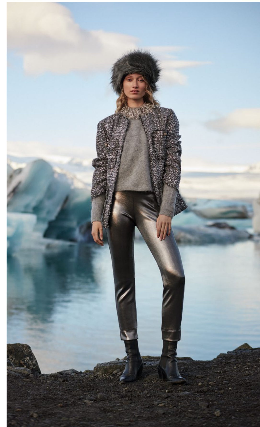
Presenting SABRINA in a glossy, lacquered jersey: this version of Sabrina brings a high-fashion edge with its sleek, cool and lustrous finish