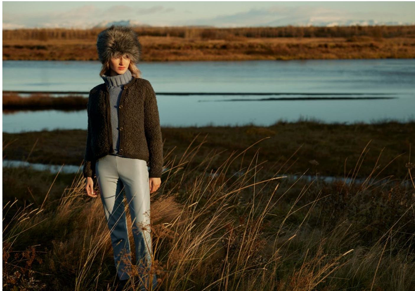
CINDESSA in a sky blue vegan nappa leather, which brings freshness and serenity to the style SABRINA with a captivating winter-inspired Pucci pattern in seasonal hues