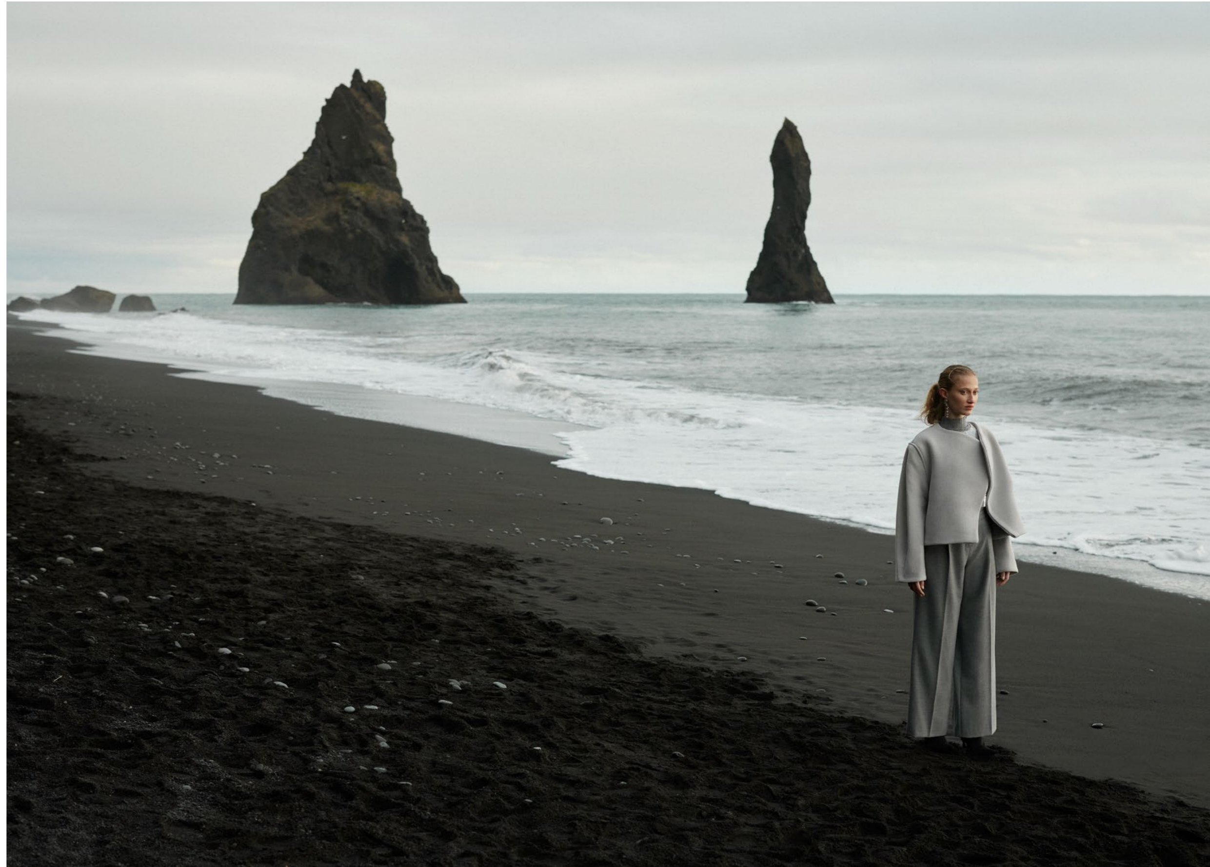
Sophisticated and cool: wide-leg pants ARTA in a stone-grey blended soft Panama fabric