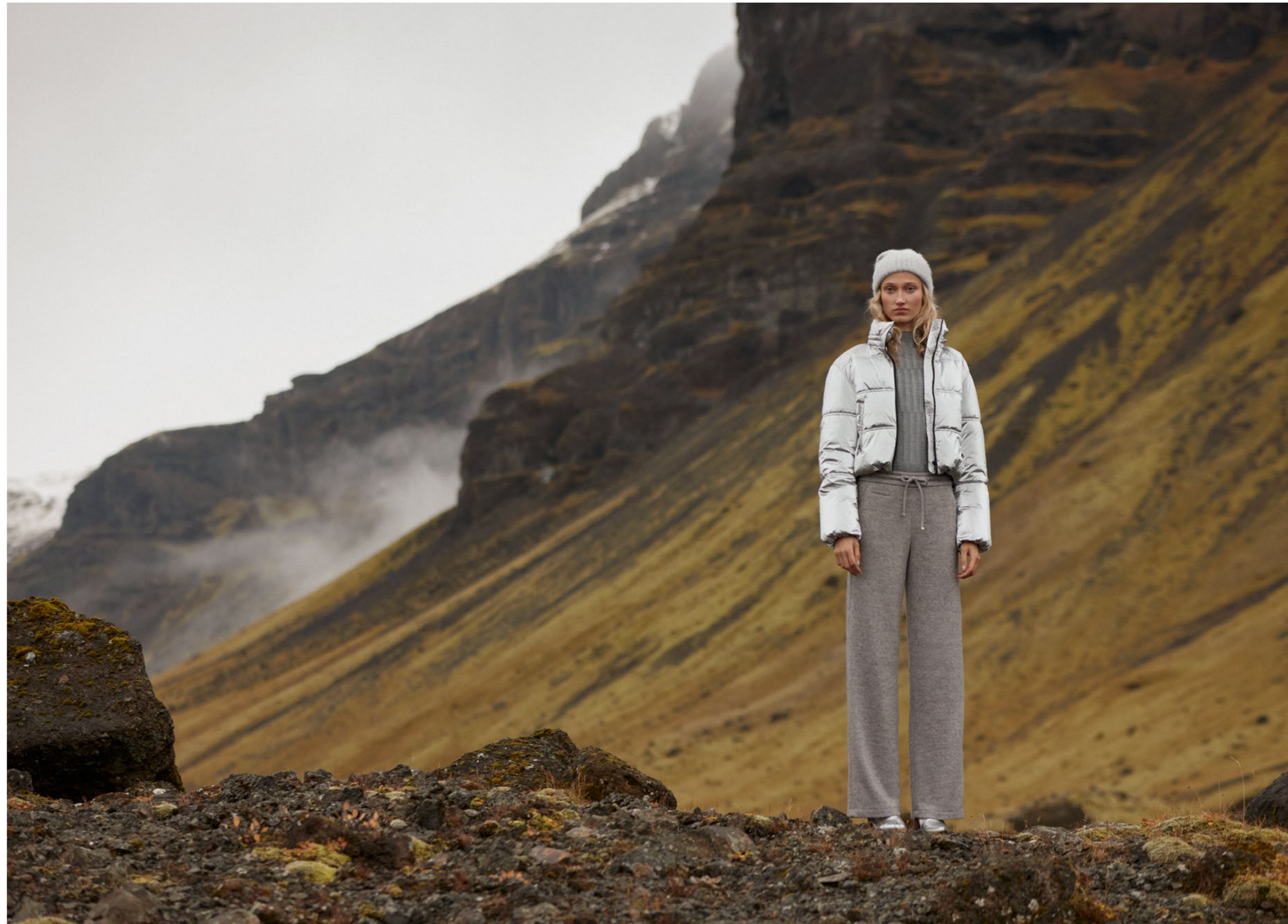
Where coziness meets elegance: jogg-pants FREDDY in a steel-grey, soft jersey which is enhanced with a silvery lurex