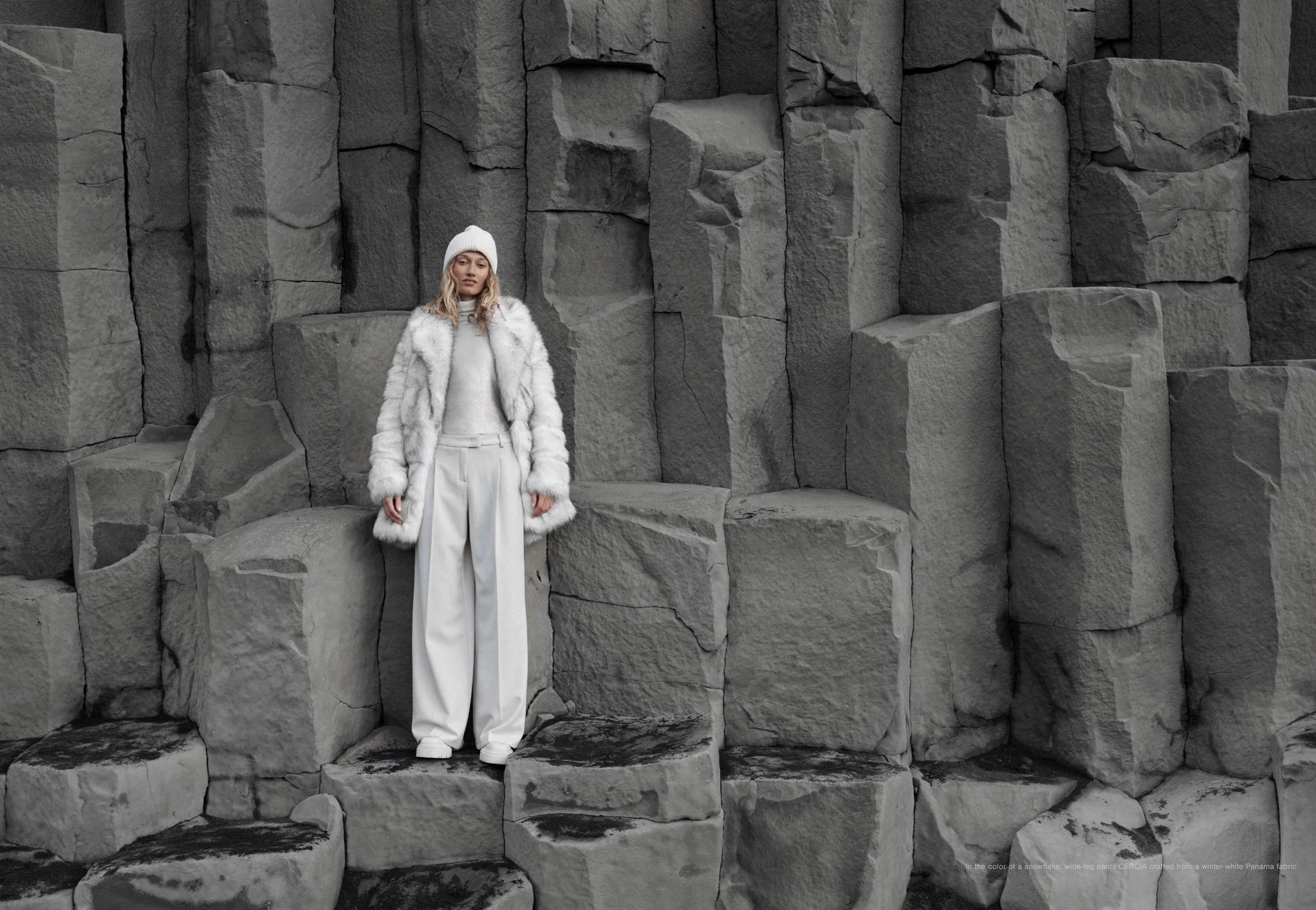
In the color of a snowflake: wide-leg pants CERCIA crafted from a winter-white Panama fabric