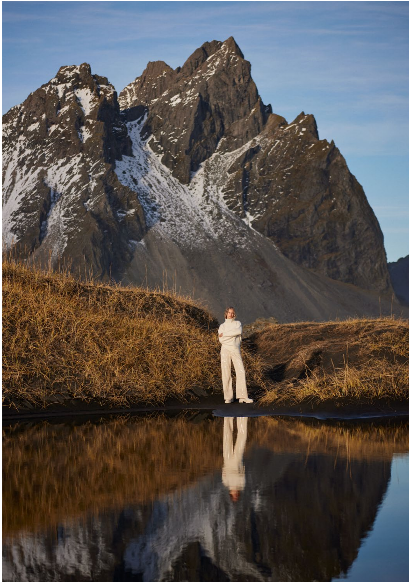
So SEDUCTIVE: pants IRIS in a fluid sequin fabric, that comes in the color of sparkling champagne