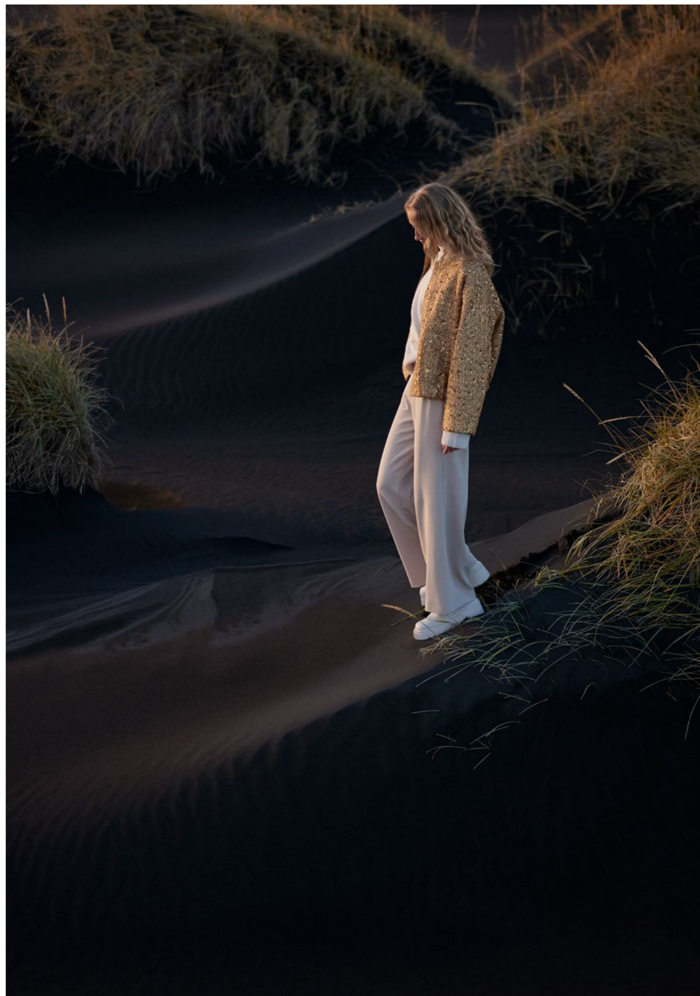
Showstopper: super wide-leg MAYA in a black Cadé Simply chic pull-on pants ROSANNE with a wide leg, shown in a luxurious, ivory colored Cadé