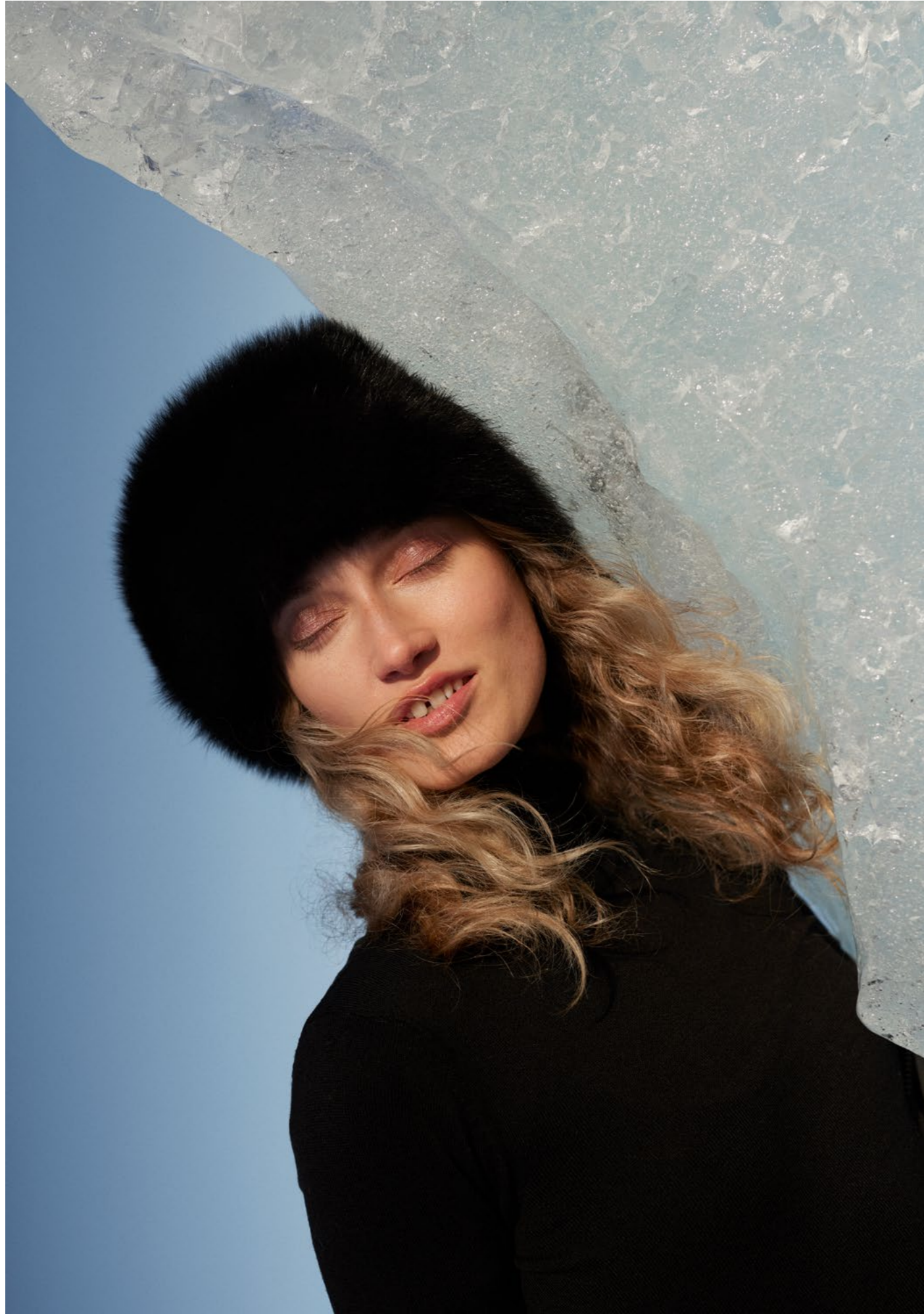
Cool as ice: the new style JULIETTE has an asymmetrical wrap and is made of fluid black Cadé