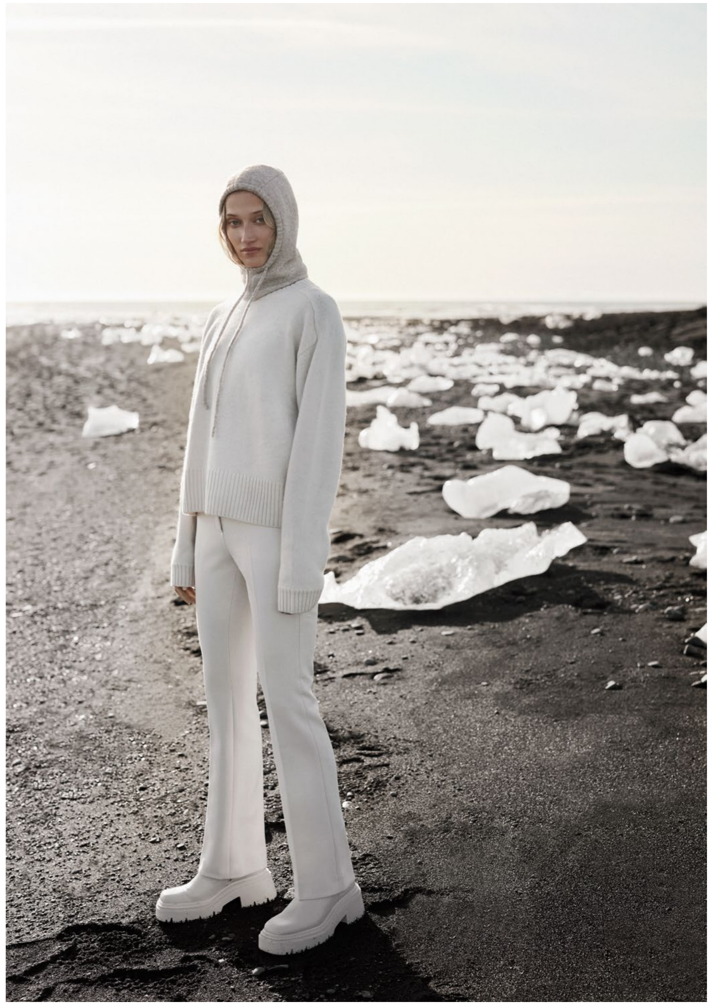
Beloved pull-on pants CINDY in a deep black jersey, accentuated with black Swarovski stones Slim-leg pants CARO with a subtle baby kick in a luxurious cream colored double fabric