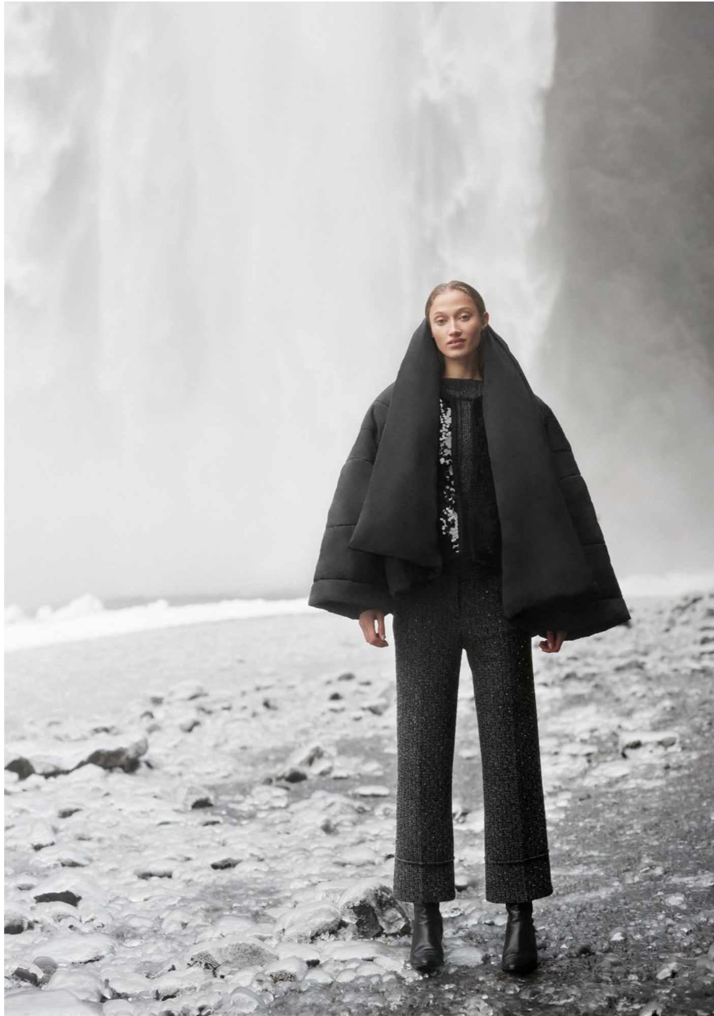
This rendition of pants MIA combines the sophistication of multi-grey tweed with the sparkling allure of black sequins