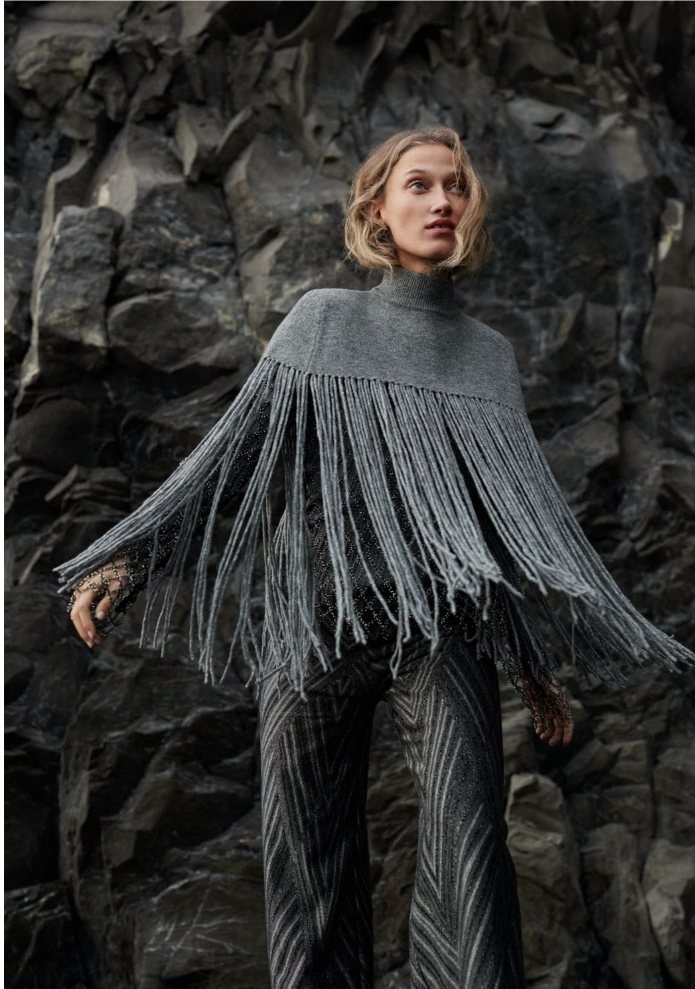
Presenting the highlighted KIMBERLY in tones of silver and grey: this version of Kimberly takes inspiration from the icy allure of glaciers, translating the lurex jersey into a fabric that shimmers, catches the light and gives it a modern and dynamic vibe