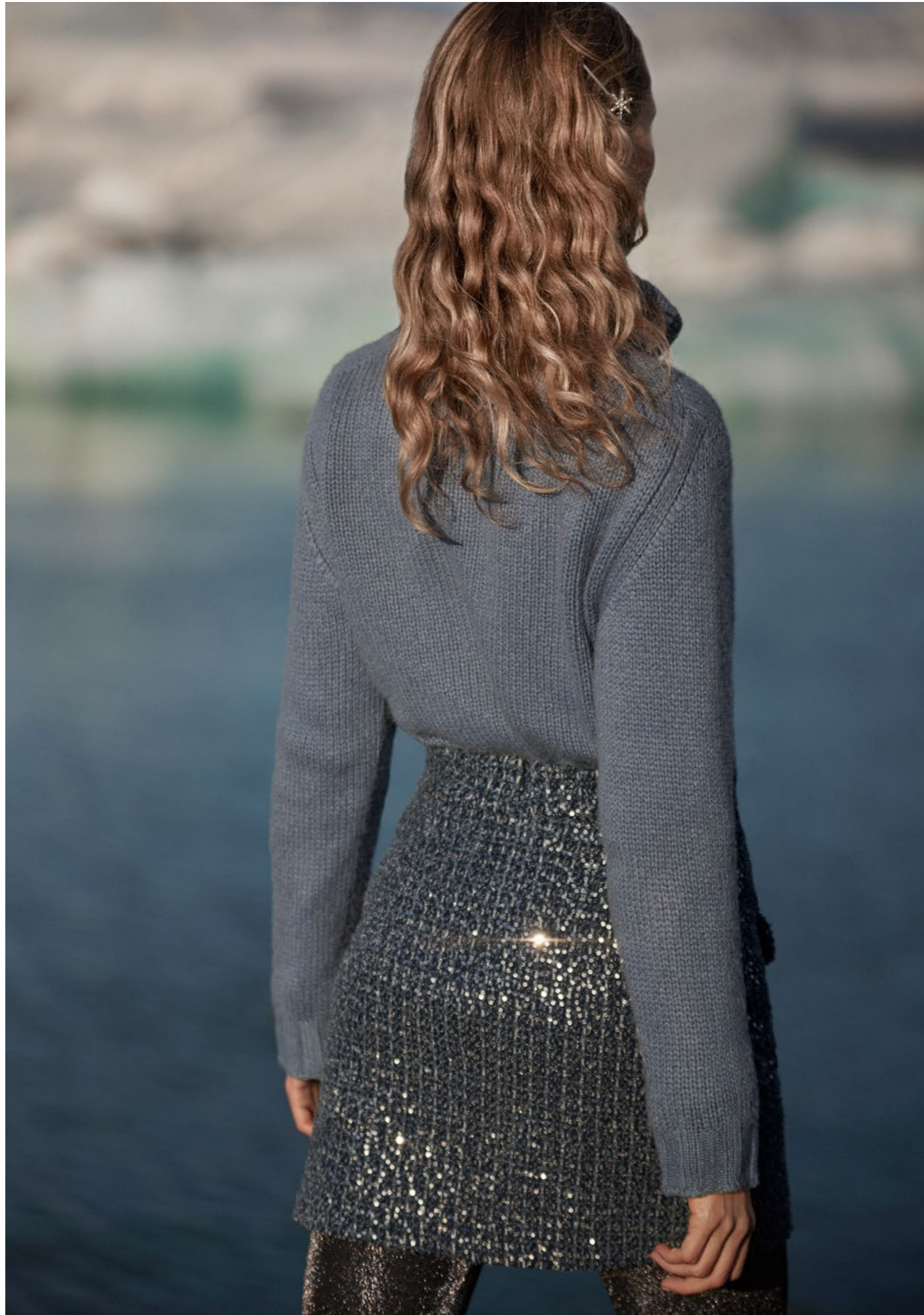
Shines bright: skirt PARIS in a jeans-blue tweed with extra-sparkling silver sequins