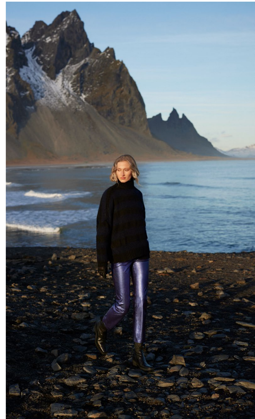
Stunning CLAIRE CROPPED in an electric blue metallic vegan leather brings cool modernity