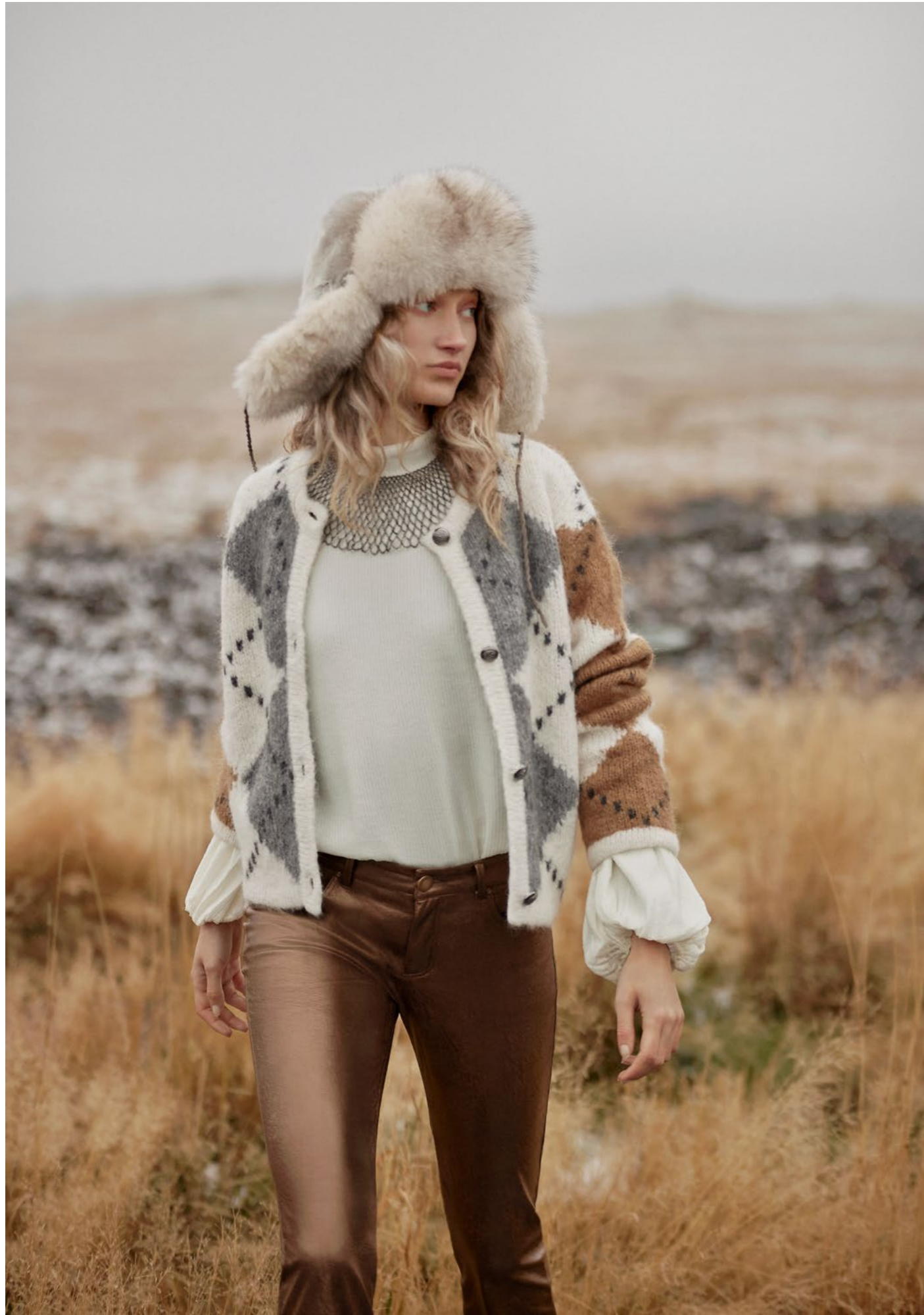
The shiny bronze metallic vegan leather adds a touch of cool glamour to 5-pocket style CLAIRE